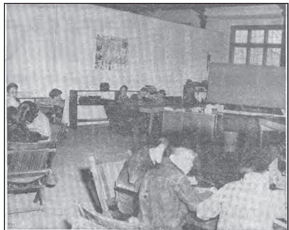
NOT A MODERN SCHOOLROOM BY ANY MEANS, but serving the need for temporary classroom space is this room in the Kent Community House used for the first time yesterday by pupils of Kent Center school. The school was badly damaged in a fire last Friday.